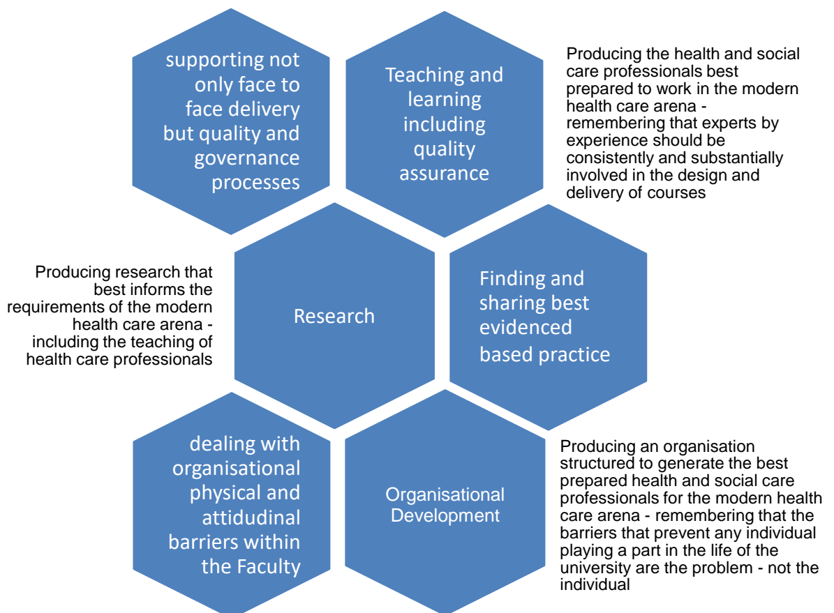
Figure 1. How teaching, research and Faculty functions relate to produce high caliber health and social care professionals

The diagram below illuminates how these different activities are interlinked: