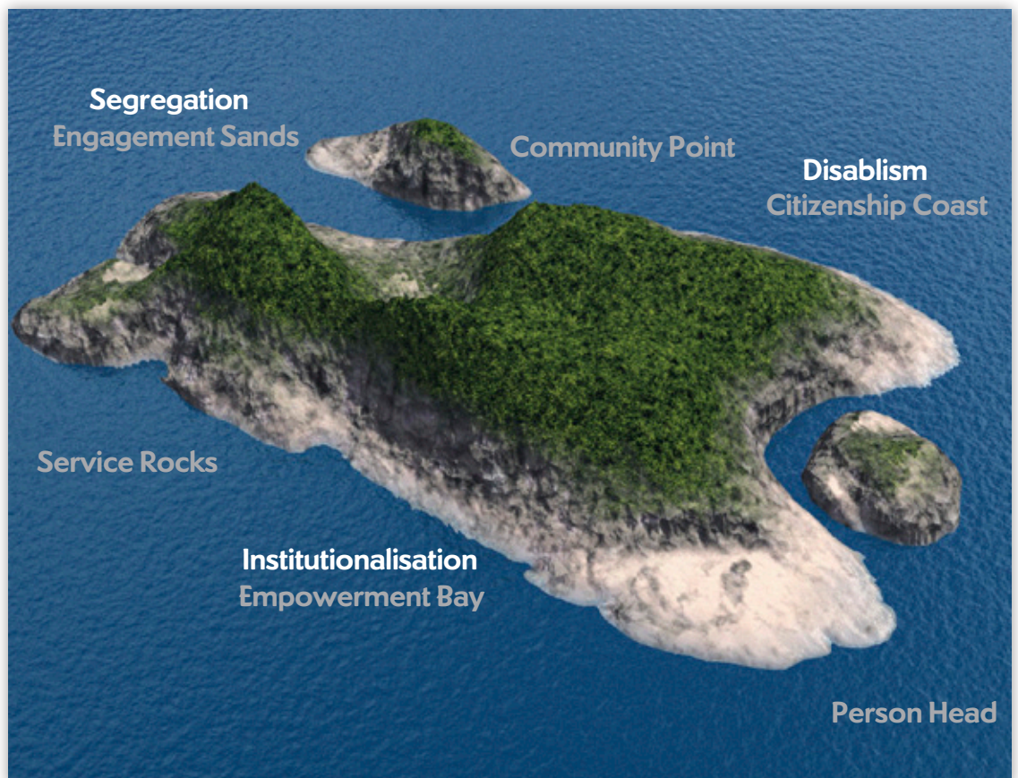
Figure 2: Dangers around Triangle Island