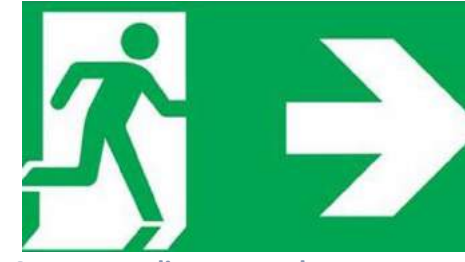
A man standing on one leg next to an arrow

furnished in its own right and offers inviting glimpses of other levels, so one care home provider<sup>141</sup> has replicated this<sup>142</sup>, despite the fact that many residents need to use a lift<sup>143</sup>. Complicated buildings generate a demand for wayfinding support such as signage and trails<sup>144</sup> despite the fact that signs are not always easy to interpret. Wayfinding signs<sup>145</sup> have been removed in some care facilities to make the place more homelike<sup>146</sup>, while others advocate use of colour contrasts<sup>147</sup> and strategically placed furniture or other building features to help people find their way around the building.